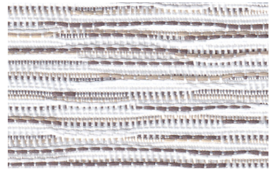
TOWER TAUPE (L/F) 1104 (B/O) 1904