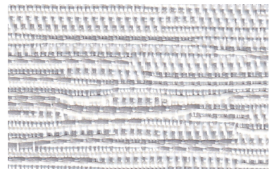
SILVER BRIDGE (L/F) 1107 (B/O) 1907

* (L/F) stands for light-filtering and (B/O) stands for blackout